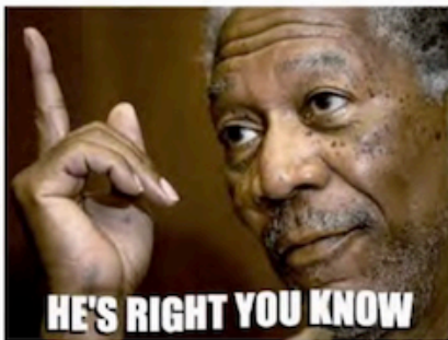
Image: Pointing Up Morgan Freeman GIF by MOODMAN (GIF image).gif (300 KB)

13 #9870 14 MM [REDACTED] we flagged tons of content Matt don't agree on at all 9:12 PM 15 MM [REDACTED] tons 9:12 PM 16 JM [REDACTED] Well, no I still think the team is following the rules as written 9:12 PM 17 MM [REDACTED] the rules are too vague 9:13 PM 18 JM [REDACTED] The problem is that management doesn't want the rules enforced as written 9:13 PM 19 20 PD [REDACTED] 9:13 PM 21 File sent: Pointing Up Morgan Freeman GIF by MOODMAN (GIF Image)